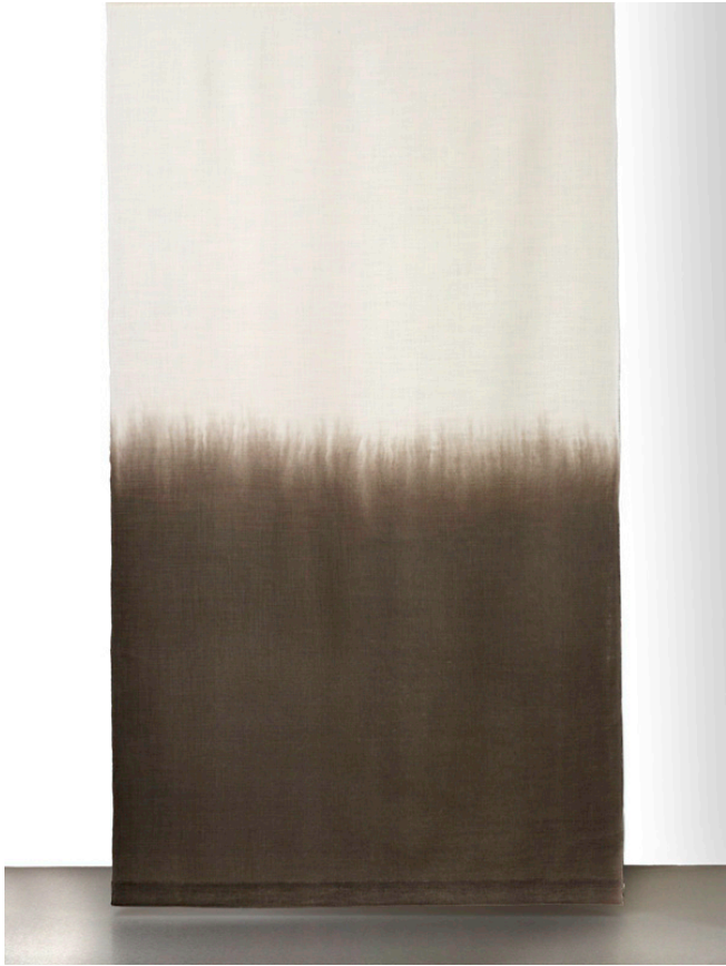
Y134-01 CAPILLARY ACTION Charcoal