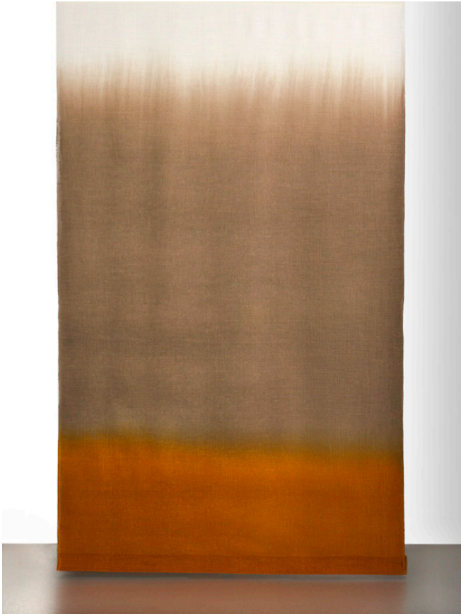
Y134-02 CAPILLARY ACTION Rust

Two or three-part feathered horizontal ombré, hand-dyed on drapery weight ground. NOTE: Expect bleed height to vary across the panel and from panel to panel. The design is painted to precise dimensions and completed naturally by capillary action.