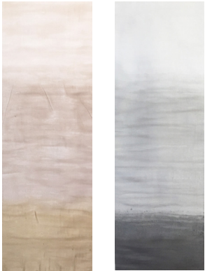
Y138-01 Dusty Rose