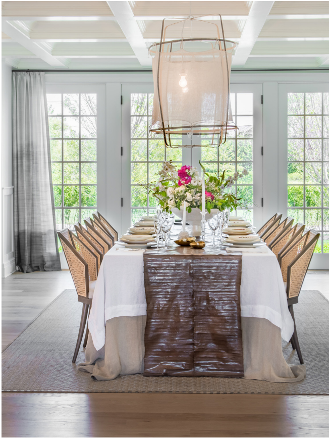
Y138-02 CAMBRIA OMBRE Amagansett | Interior by Kara Mann

Three-part textured horizontal ombré, hand-dyed on "lawless" dupione silk. NOTE: The inherent variation and irregularities of hand-dyeing on "lawless" dupione silk give this design its ever-changing character.