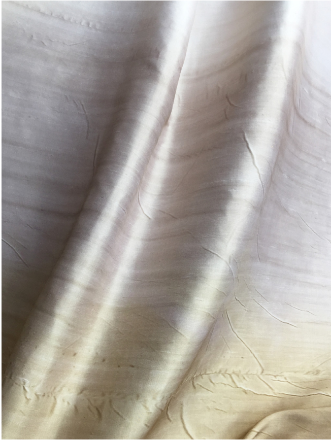
Y138-01 CAMBRIA OMBRE Dusty Rose