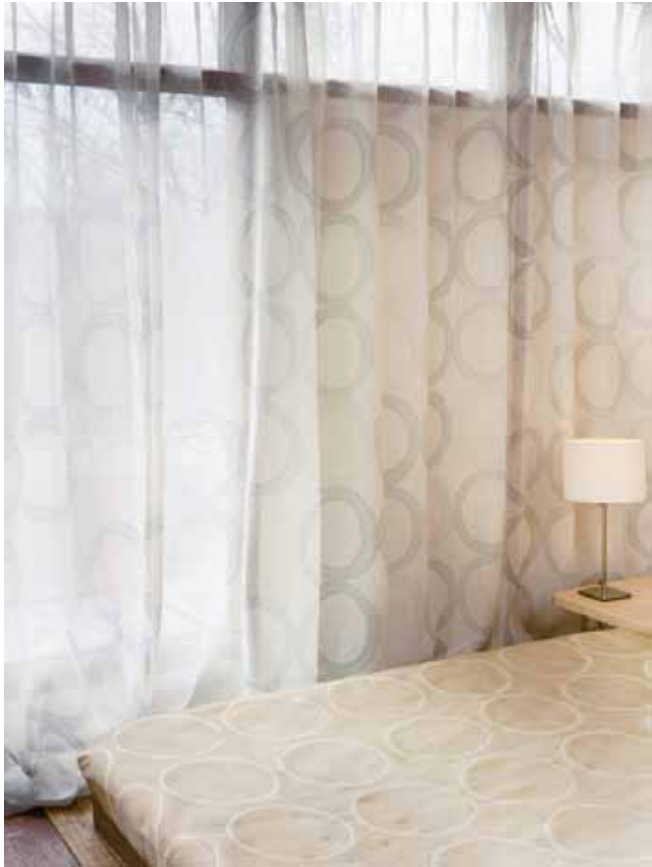
Y1083 HOPSCOTCH Sky/Linen Sheer