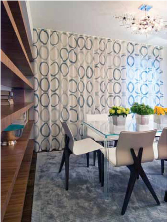
Y10811 HOPSCOTCH Deep Blue Sea/Draper-weight Linen Blend

Two-tone circle motif, handpainted on a variety of grounds, including linen sheer, drapery-weight linen blend, and silk.